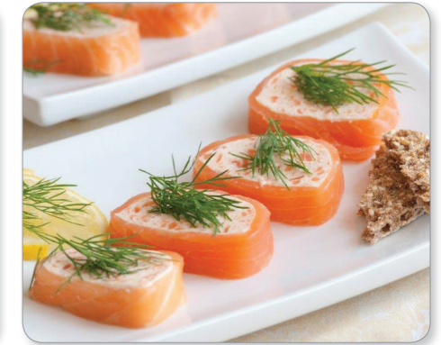
Roulade 6 x 300g Case