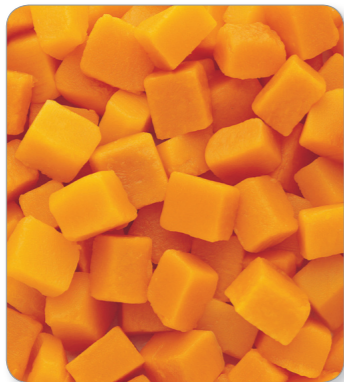
Butternut Chunks 6 x 1Kg Case