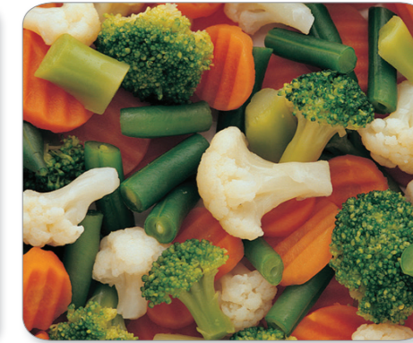
Country Mix 6 x 1Kg Case