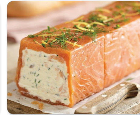
Terrine Salmon Trout 4 x 500g