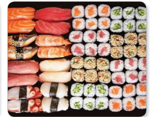
Sushi Assorted (Various) 50 Units (Made to order)