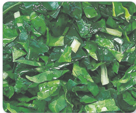
Spinach Chopped 12 x 1Kg Case