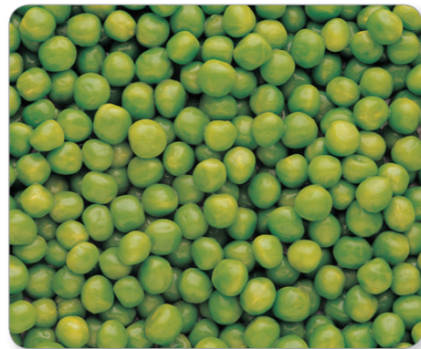
Peas 6 x 1Kg Case