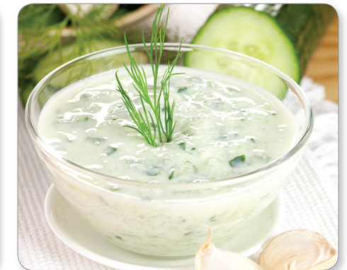
Tzatziki 2.5Kg Unit (Made to order)