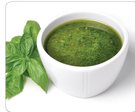
Basil Pesto 1Kg Unit