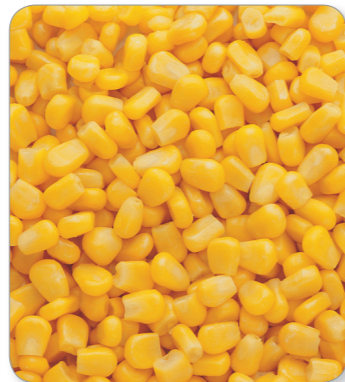
Cut Corn 6 x 1Kg Case