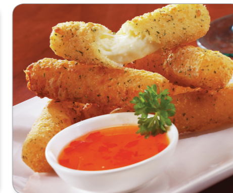
Mozzarella Sticks 6 x 1Kg Case