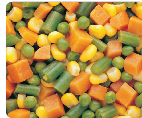
Mixed Vegetables 6 x 1Kg Case