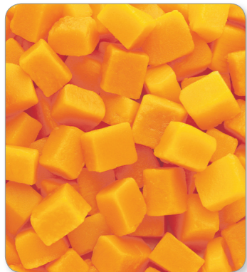
Pumpkin Chunks 6 x 1Kg Case