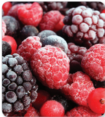
Mixed Berries Frozen 4 x 1Kg Case (Subject to availability)