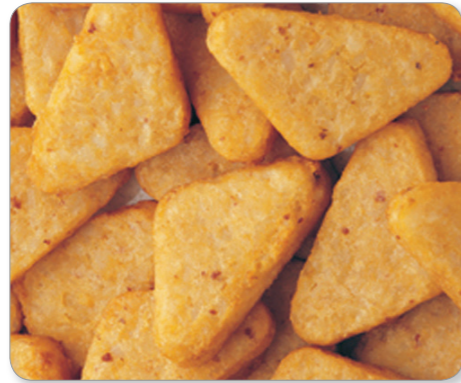
Hash Browns Triangular 6 x 1.5Kg Case