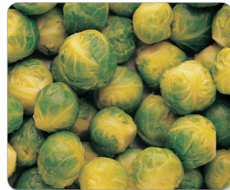
Brussel Sprouts 6 x 1Kg Case