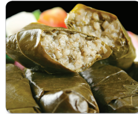
Dolmades 2Kg Unit (Made to order)