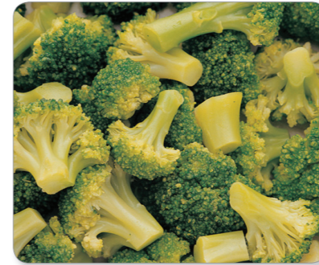
Broccoli 6 x 1Kg Case