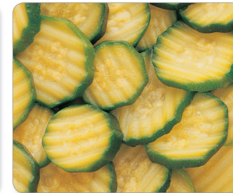
Marrow Roundels 6 x 1Kg Case