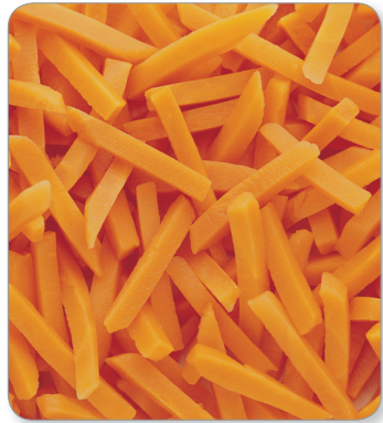
Carrots Julienne 6 x 1Kg Case