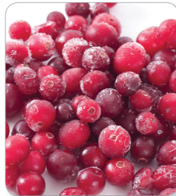
Cranberries Frozen 4 x 1Kg Case (Subject to availability)