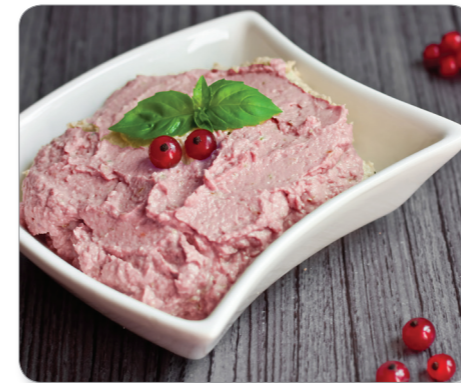
Taramosalata 2.5Kg Unit (Made to order)