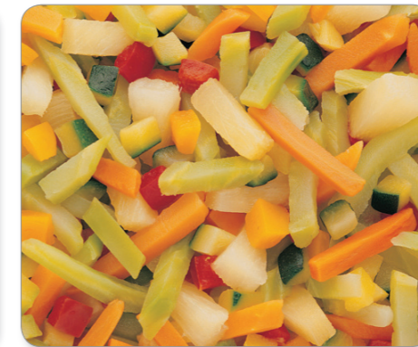
Stir Fry 6 x 1Kg Case