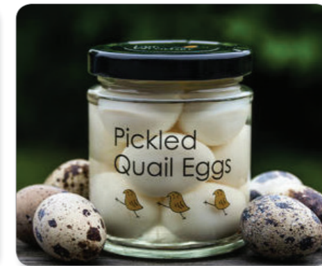
Quail Eggs 310ml