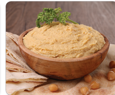
Humus 2.5Kg Unit (Made to order)