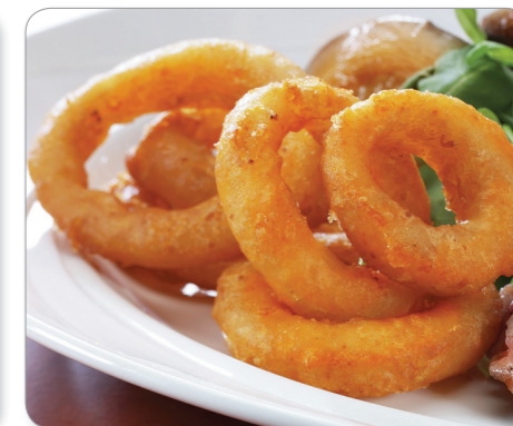
McCain Onion Rings Formed 10 x 1Kg Case