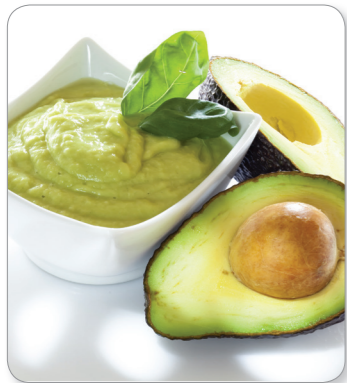
Avocado Puree 1Kg Case