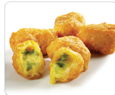
Chilli Cheese Nuggets 6 x 1Kg Case