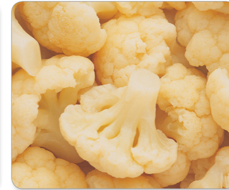
Cauliflower 6 x 1Kg Case