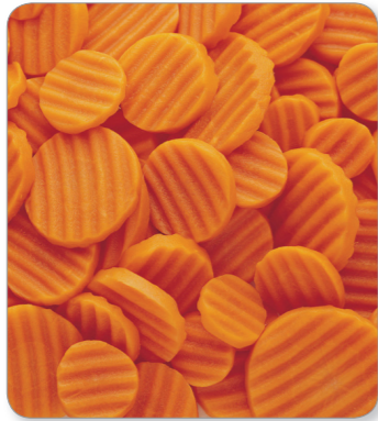
Carrots Rondels 6 x 1Kg Case