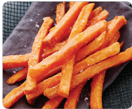
Sweet Potato Chips 4 x 2.5kg Case