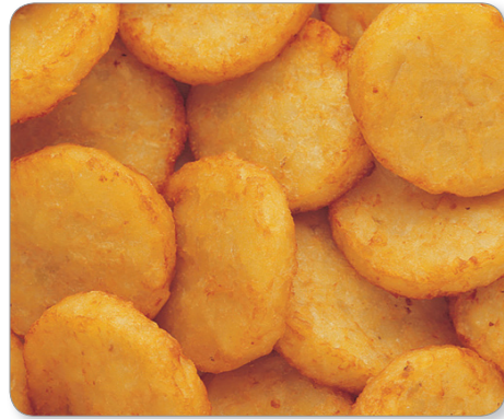
Hash Browns Round 8 x 1.2Kg Case