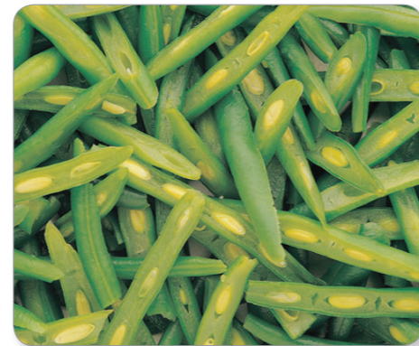
Beans Sliced 6 x 1Kg Case