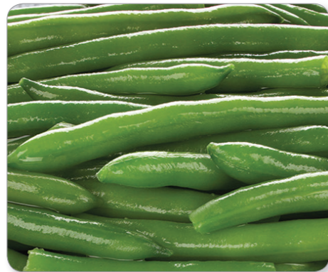
Whole Green Beans 6 x 1Kg Case