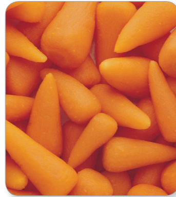
Carrots Fingerlings 6 x 1Kg Case