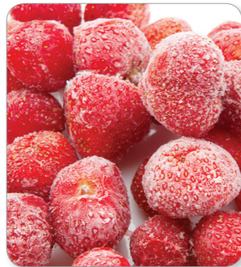
Strawberries Frozen 4 x 1Kg Case (Subject to availability)