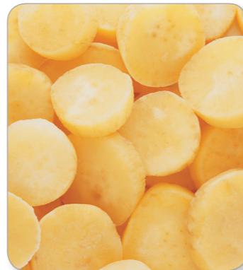
Sweet Potato Chunks 6 x 1Kg Case